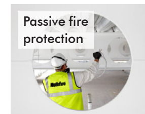
Passive fire protection Intumescent Coatings, Fire Stopping