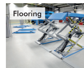
Flooring Seamless Resin Flooring, Subfloor Preparation, Car Parking Structures