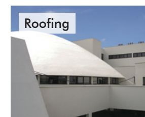
Roofing Liquid Applied Systems, Felt Systems, Vegetated Roofing