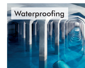
Waterproofing Potable & Waste Water Industry, Balconies, Podia & Terraces, Basements & Foundations